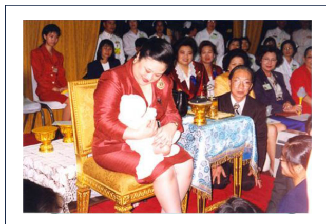
Figure 1. Her Royal Highness Princess Soamsawali holds a baby born to an HIV-positive mother who was enrolled into the Princess Soamsawali PMTCT programme

The TRCS PMTCT regimen has been updated continuously as new scientific evidence emerges. For example, it was shortened to an 8-week antenatal period in 1998 when our initial results showed